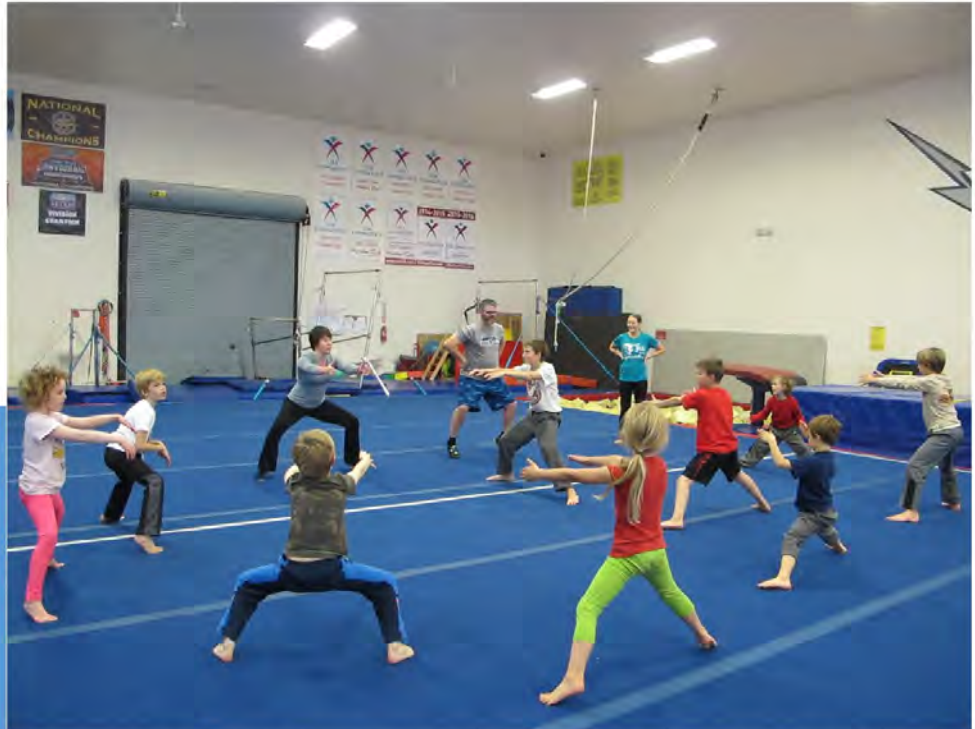
Cooper Landing students participate in gymnastics at River City Cheer.