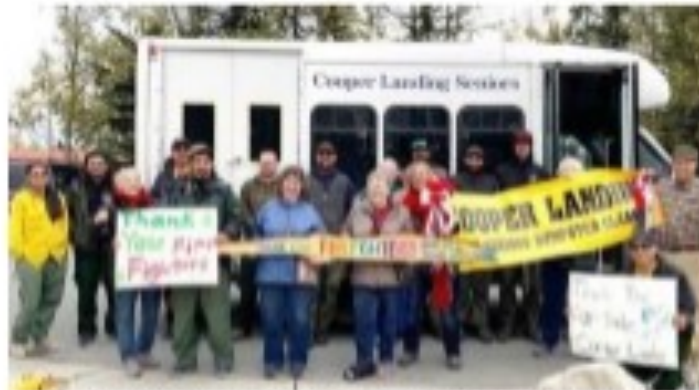
Cooper Landing seniors pose with firefighters during a special First Responder BBQ celebration at Soldotna Creek Park on Sept. 9.