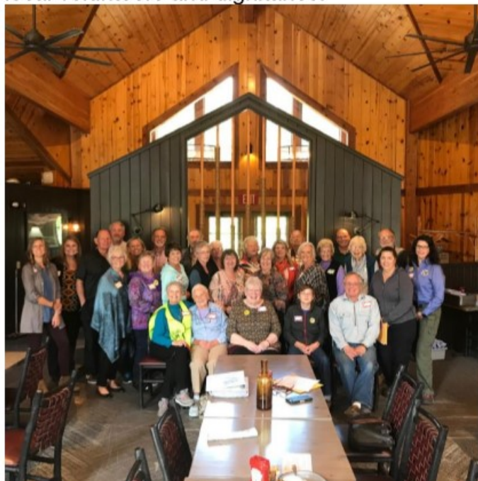
2019 Volunteer Appreciation Luncheon at Kenai Princess Wilderness Lodge.