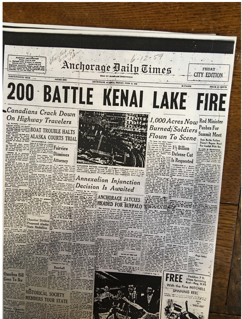
Photo from a June 12, 1959 Anchorage Daily Times about the Kenai Lake fire which came roaring down Snug Harbor Road from slash burning on the power transmission line when the Cooper Lake Dam project was being built.