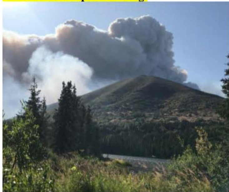
The Swan Lake Fire started from a lightning strike on June 5.