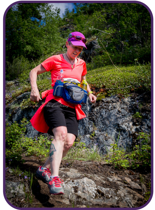
A runner participates in a previous Cooper Landing Trail Run.

If you are able, please consider donating to a trail organization. You can help our efforts by mailing a check with the memo "Walkable Community" made out to the: